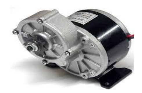
Fig 6 DC Motor

In this project we used one DC motors which are mounted on backward wheel shaft and the capacity of motor is 3850 rpm.