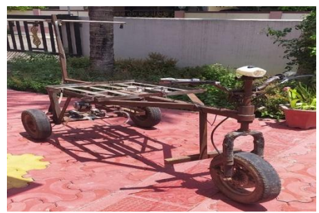
Fig.4 Actual Design