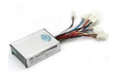
Fig 7 Motor controller

Motor speed controllers are electronic devices that control motor speed. They take a signal for the needed speed and drive a motor to that speed. There are a variety of motor speed controllers available. DC Motor power opamp speed controller.