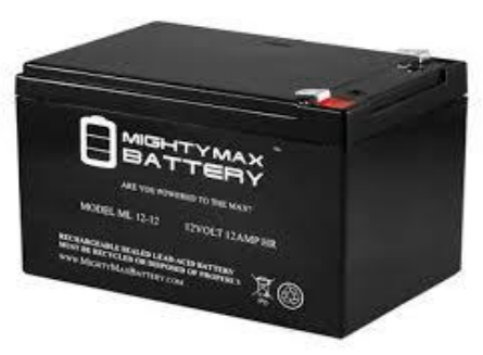
Fig.5 power supply

This is an important block why because all the components require power supply to be operating. In or project 12v 12Ah battery are used. There are 4no.of batteries are used. This Micro controller requires +5v, relay requires 12v and DC